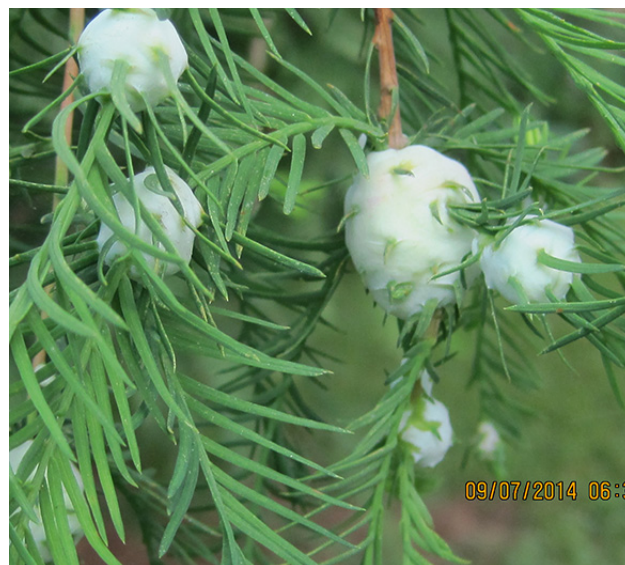
Sherrie Sanders, University of Arkansas Cooperative Extension

Baldcypress may also be attacked during the hot summer months by the Baldcypress Rust Mite, Epitrimerus taxodii . Rust mites are microscopic eriophyid mites, most active during the warm season. Symptoms are needles becoming yellowish and then brown. Serious infestations can cause the entire tree to turn a rusty brown color. The white cast skins of the mites are the easiest way to diagnose the presence of rust mites. Applications of Carbaryl (Sevin), or Abamectin (Avid), or Insecticidal soap will control the mites if good coverage is achieved. Bayer Advanced Insect Control for Trees and Shrubs is a systemic insecticide that is very effective and does not require as many applications. Baldcypress is very sensitive to horticultural oils so avoid the use of oils for mite control on Baldcypress.