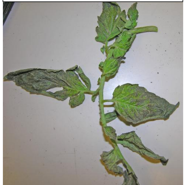
Sherrie Smith University of Arkansas Cooperative Extension

Tomato spotted wilt virus, (TSWV) , is putting in an appearance across the state. Symptoms include stunting, wilting, and sometimes a one-sided growth habit. Young leaves often turn a bronze or black color with numerous dark spots. Growing tips may die back. Young plants with these symptoms will usually not produce fruit. Older plants will fruit, but the fruit will have chlorotic rings and necrotic spots. Potatoes, peppers, and eggplant are among the many plant hosts that are vulnerable to TSWV. There is no cure or treatment for any viral disease. Affected plants should be pulled up