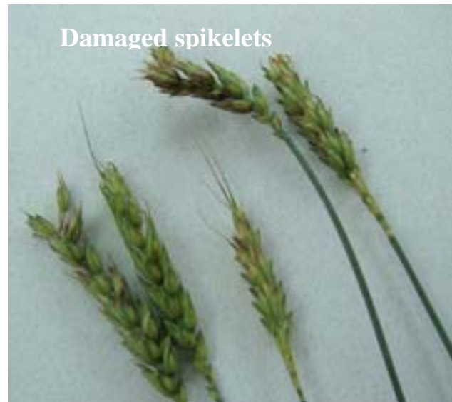
Bob Scott University of Arkansas Cooperative Extension

In cases of severe glyphosate drift to wheat, the flag leaf will die back as in the pictures shown. Also, damage to the collar region will result in reduced flow of plant energy to the seed head. This results in malformed, damaged seed heads. Some of the individual spikelets in these photos are beginning to turn black. Yield loss will be significant.