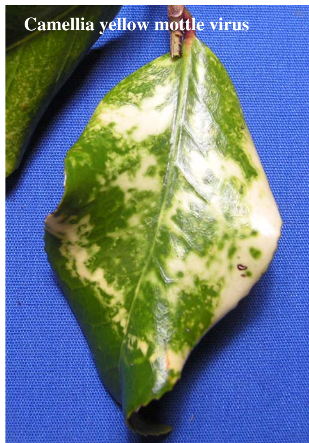
Camellia yellow mottle virus

Camellia yellow mottle virus (CYMoV) affects only camellias. Visual symptoms are leaves with a bold mottled pattern of dark green and pale yellow. The disease appears to develop slowly within the bush, with initially only a few branches showing infection. The symptoms may show one season and not the next, although the plant will still have the virus. CYMoV is thought to be graft transmitted and not passed from one plant to another in a garden setting. It appears to have little effect on plant vigor or flowering and is often tolerated, since it poses no threat to other plants. The virus can be confused with mite injury which causes yellow stippling on seriously affected leaves. Virus is not curable. Some plants will have both virus and mites. Do not purchase plants with these symptoms.