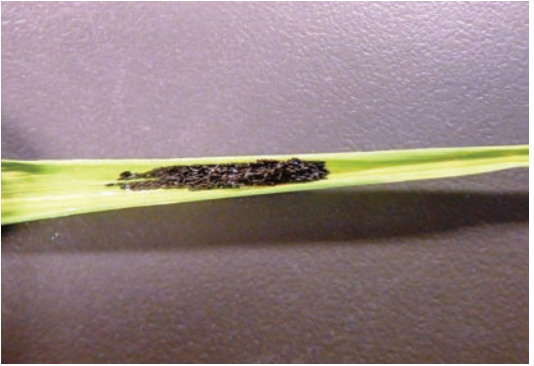
Rice water weevil egg mass.