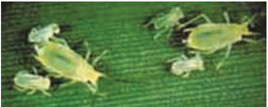
Adult and nymph greenbugs.