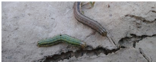
Fall armyworm larvae.