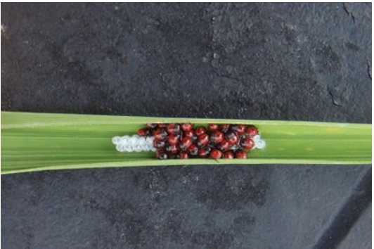
Just-hatched rice stink bug nymphs clustered near egg shells.