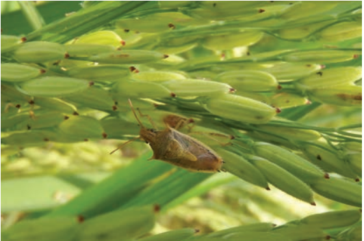
Rice stink bug adult.