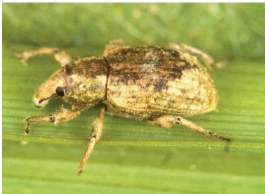
Rice water weevil adult.