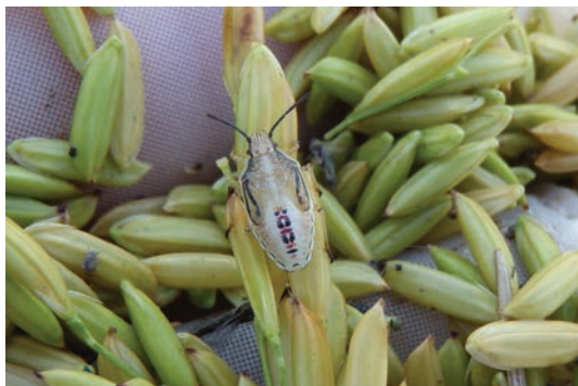
Rice stink bug nymph.