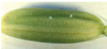
Rice stink bug feeding scars on a rice kernel.