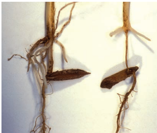
Damage by grape colaspis larvae on stem between seed and base of plant (right) compared to normal (left).