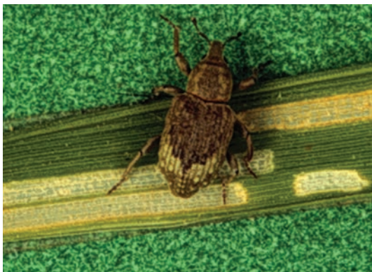
Leaf scars from adult rice water weevil feeding.