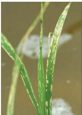
Leaf scars from adult rice water weevil feeding.