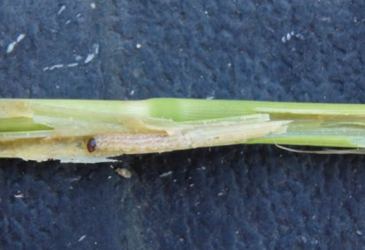
Nearly fully grown rice stalk borer larva near the bottom of the stem.