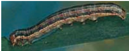
True armyworm larva.

1 CAUTION: Insecticides listed for rice insect control may interact with propanil causing severe injury to rice unless timed properly. If insecticides are necessary, the timeframe suggested cannot be followed; consider herbicide options other than propanil. Many generic lambda-cyhalothrin materials are available; consult individual labels.