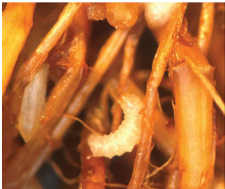
Rice water weevil larva.