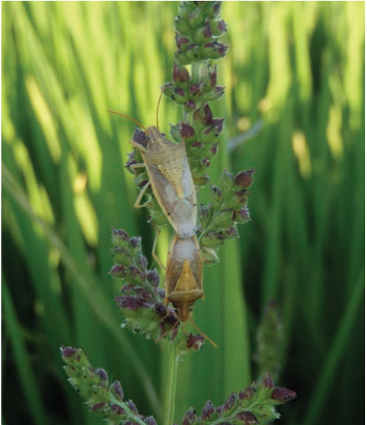
Adult rice stink bugs mating.