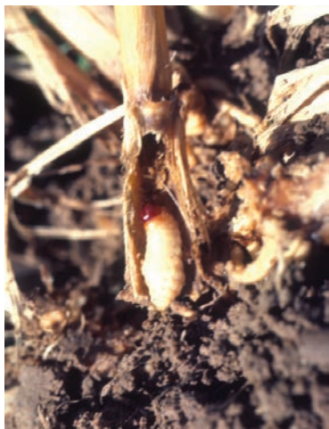
Billbug larva in cavity at base of stem.