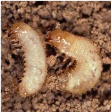
Grape colaspis larvae (Lespedeza worm).