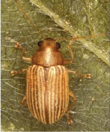
Adult grape colaspis beetle.