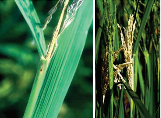
Entry hole into stem made by borer larva and whitehead (blank) due to rice stalk borer (or billbug).