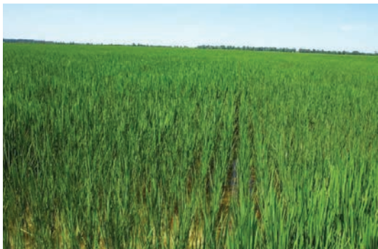
Phosphorus deficiency of rice. Notice dark green streak with stunted plants and reduced tillering.