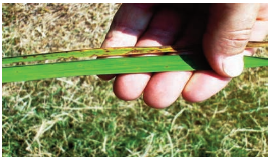
Potassium-deficient leaf (top) compared to healthy leaf (bottom). Note severe brown spot and yellow/brown leaf margins of K-deficient leaf.