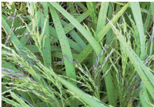
Potassium-deficient rice at heading. Note brown spot on leaves and panicles.