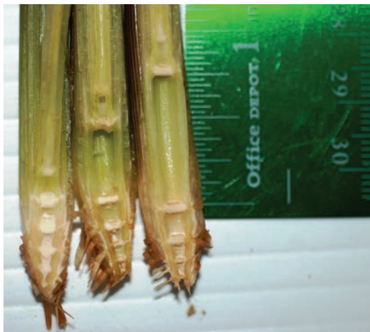
Rice stems showing internode elongation (IE). The stem on the far left is at the green ring stage (note the green band above the top node), the stem in the middle is at 1/2 inch and the stem on the far right is at 1 inch IE.

Hybrids require 30 lb N/A at the late boot stage to minimize lodging and maximize grain yield.