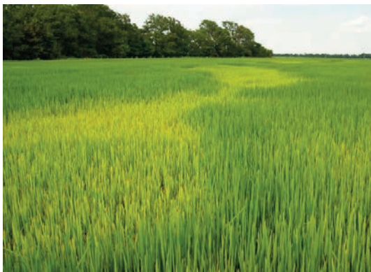
Sulfur deficiency occurring in sandy area of field.