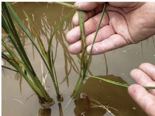
Mottled discoloration due to chlorosis and bronzing of lower rice leaves caused by prolonged zinc deficiency.