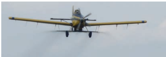
Preflood N application.

If rainfall has flooded the field and prevents the large pre-flood N application, increase the early N rate and split-apply it every week in increments of 30-45 lb N/A per application until IE.