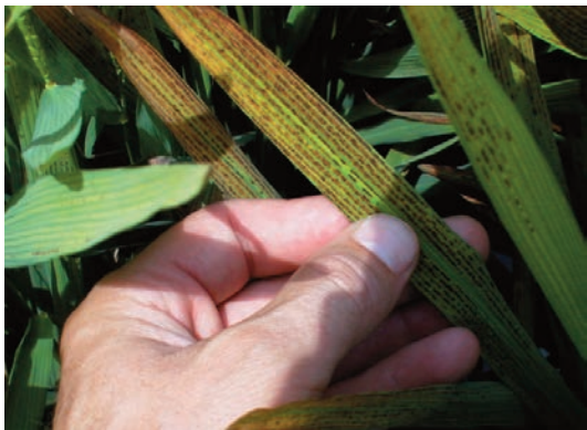
Symptoms on upper leaves due to late-season sulfur deficiency.