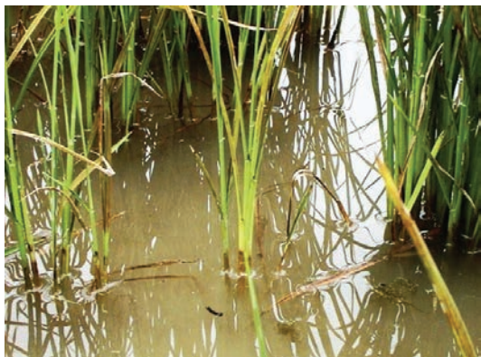
Stacked leaf collars of zinc-deficient rice plant.