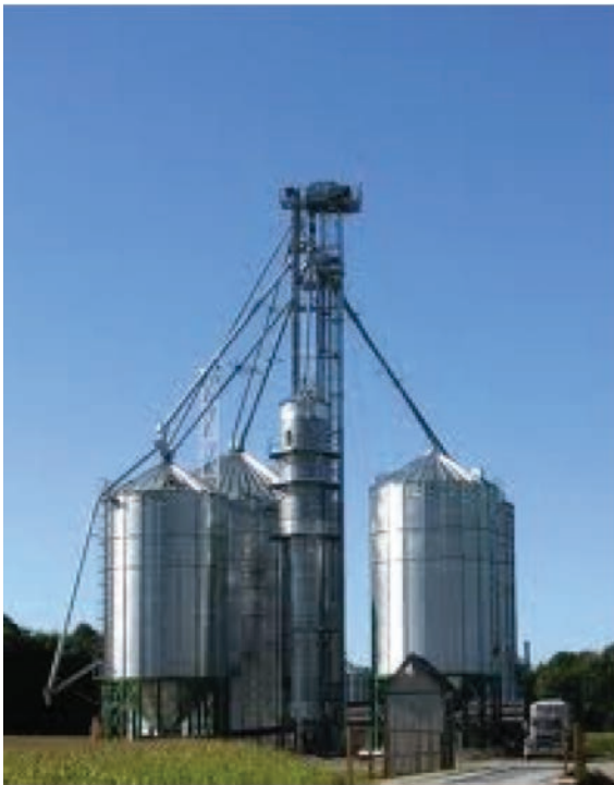
Figure 10-4. Example of on-farm grain drying and storage facility.

High temperature batch or continuous flow dryers are usually used to dry large capacities of grain sorghum. These units typically have very high airflow rates, and they do not require supplemental heat for daytime drying when harvesting grain sorghum at 18%-20% moisture range. If heat is used, the drying air temperature can be limited by cycling the burner on and off or by changing the gas burner orifice size using an automatic modulating valve.