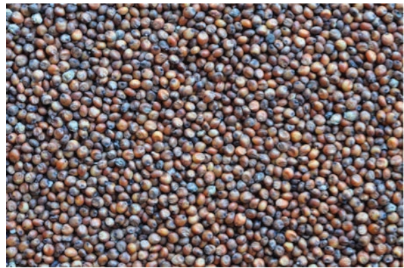
Figure 10-1. Freshly harvested grain sorghum.

The emerging popularity of on-farm drying of grain sorghum has created some discussion regarding the advantages and disadvantages of on-farm drying and storage compared with selling wet grain for the buyer to dry. Some disadvantages of on-farm drying and storage operations include added capital and operating cost of equipment and the increasing costs of high electrical power demand. Also, on-farm drying and storage operations place additional management pressure on growers as they monitor and manage the drying and storage process along with other day-to-day farming operations. Advantages for farmers who are drying and storing sorghum on the farm are that they can minimize quality loss and better manage the value of their crop. Additionally, farmers may harvest sorghum at faster rates if daily harvesting hours can be extended by replacing long trips to the elevator with short trips to their drying bin. Therefore, on-farm drying of freshly harvested sorghum has the potential to produce better quality grain and greater profits, which is appealing to farmers. Moreover, producers can use the same on-farm grain sorghum