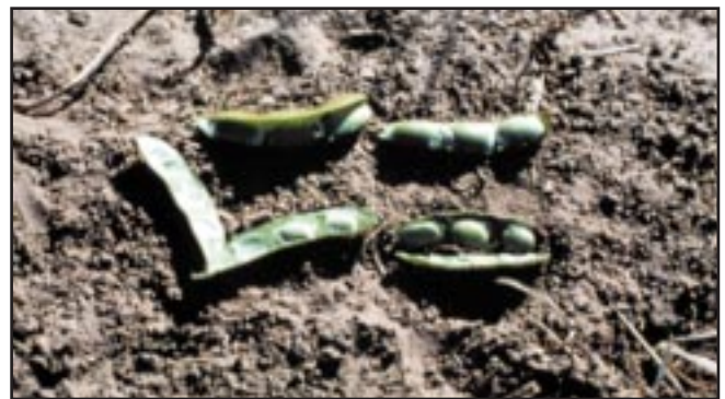
Figure 8.1. Seeds touching in the pod and ready for irrigation termination (upper two pods) along with pods needing at least one more irrigation (lower two pods).

Growers are also faced with making the decision on when to stop irrigating soybeans. The goal is to have adequate soil moisture to ensure that the seed will obtain its maximum weight. Field experience indicates that inadequate moisture for full seed development can result in as much as 10 bu/ac yield loss. A practical rule of thumb for terminating irrigation is to determine if 50 percent or more of the pods have seeds that are touching within the pod. (The upper two pods in Figure 8.1.)