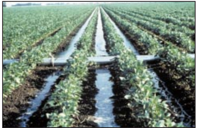
Figure 8.3. Furrow irrigation with gated pipe.

in 10 hours or less. Watering much longer than this can cause overwatering at the top of the row and cause problems, especially if it rains and stays cloudy soon after the irrigation. This has become more of a concern with the expanded use of irrigation tubing with punched holes for furrow irrigation. The tendency with the tubing is to punch holes as long as water still comes out of them without much concern for how long it will take to water out the row. This is desirable from the standpoint of not having to plug and open holes and operate the tubing in sets. However, the caution is to water according to what is more effective for the field and crop rather than what is easiest.