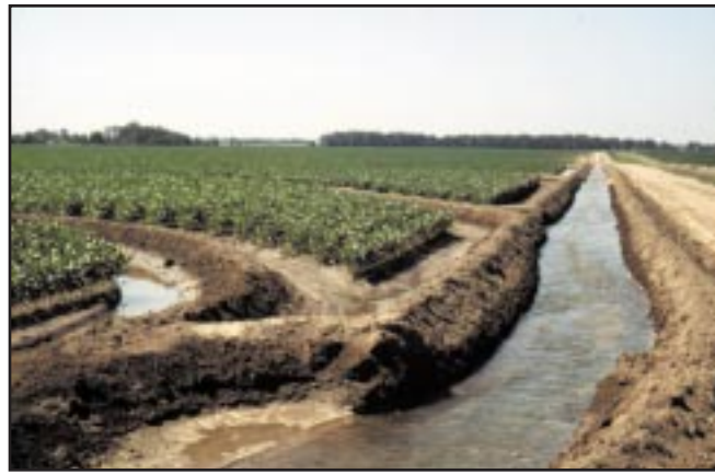
Figure 8.2. Levee irrigation with flume ditch for multiple inlets into field.

Levees should be marked early to strengthen the commitment to pull levees and irrigate when needed. The levee spacing depends on the slope, but spacing on a vertical difference of 0.3 to 0.4 feet is common. A narrower spacing on a 0.2- to 0.3-foot vertical difference may be necessary on very flat fields or when trying to irrigate small beans (less than 8 inches tall). Levees are often broken in several places or completely knocked down to get the water into the next bay. Rebuilding the levee in time for the next irrigation is often difficult because the levee area tends to stay wet. Some growers install