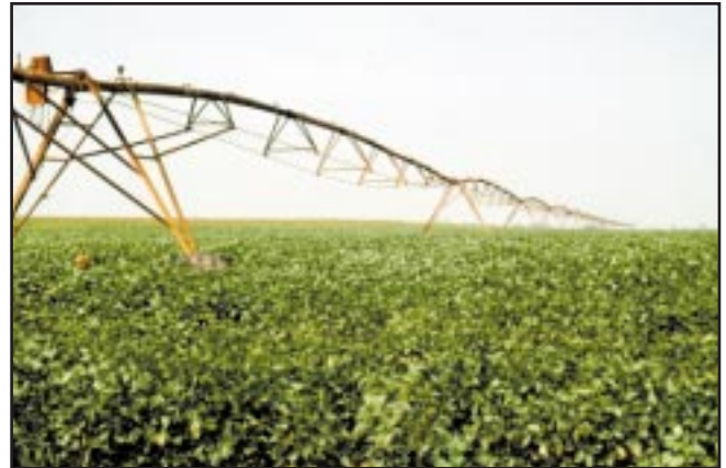
Figure 8.5. Center pivot sprinkler system.

Pivots are best suited for large square-, rectangular- or circular-shaped fields free of obstacles such as trees, fences, roads, power poles, etc. Field ditches are also a concern if the pivot towers must be able to cross them. Pivots can cover a range of acreage depending on the allowable length, but the common 1/4-mile system will cover approximately 130 acres of a 160-acre square field. It is also possible to tow a pivot from one field to another. It is usually best for a system not to be towed between more than two points during the season.