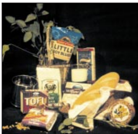
Figure 18.1. Products made from soybeans include tofu, soy milk and soy chips.

A typical bushel of soybean grain (60 pounds) will yield about 11 pounds (18.3 percent) of oil and 48 pounds (80 percent) of protein-rich meal. Hulls make up the remaining 1.7 percent. The relatively high oil and protein content and the almost infinite uses and transformations of soybean grain have resulted in the crop being referred to as the “Cinderella Crop.” This chapter will briefly address the extraction processes used to obtain the raw products and will concentrate on some of the new and very beneficial uses of the soybean.