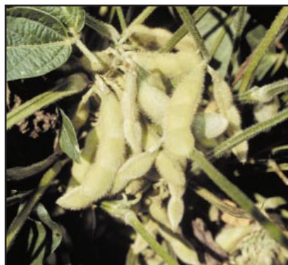
Figure 16.1. Crop rotation generally increases soybean yields.

Rotation – Research consistently shows that rotating soybeans with rice, grain sorghum, corn or cotton increases soybean yield potential (5 bu/A is common). Gains in yield potential probably arise from breaking cycles of diseases, weeds and insects, and by a general increase in soil productivity.