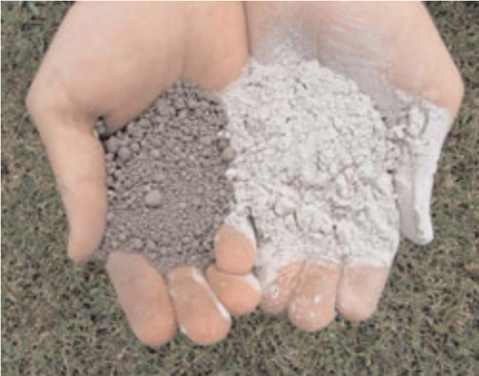
Figure 2. Comparison of pelletized lime (left) and pulverized limestone (right).

Liming materials with a fine particle size such as pulverized limestone may be difficult to distribute accurately with a rotary spreader but can be more easily distributed with a drop spreader (Figures 2 and 3). Lime can be pelletized so that many small particles are bonded together, which allows the product to be more easily applied (Figure 4). Pelletized liming materials can be distributed with a rotary spreader or a drop spreader.