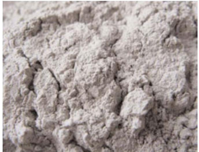
Figure 3. Pulverized limestone has a very fine texture and is more easily applied with a drop spreader.