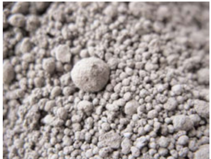
Figure 4. Pelletized lime can be applied with either a drop or rotary spreader.