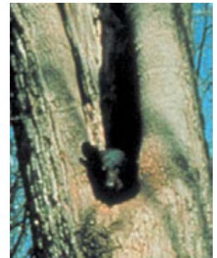
Figure 1. The American black bear in a tree and in its den at the White River National Wildlife Refuge.

destruction. In the early 1900s, much of Arkansas' forestlands were logged and cleared for farmland. By the 1930s, less than 50 black bears were thought to remain in the state, with most residing in what is now the White River National Wildlife Refuge in southeastern Arkansas.