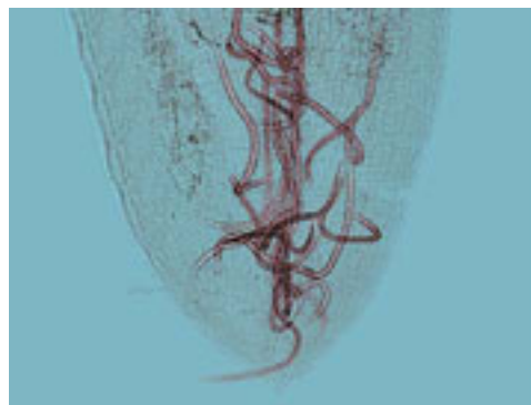
Figure 1. Immature root-knot nematodes attacking root tip (highly magnified).

First, look for plants that are not performing well. Usually, not all of your plants will be affected to the same degree, and some will be “more sick” than others. Symptoms can include stunting, yellowing, wilting during the heat of the day with recovery at night, fewer and smaller fruit and general decline – usually during the summer as the plants get bigger.