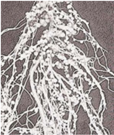
Figure 4. Roots of a legume. Nitrogen-fixing nodules are attached only to the sides of roots.

Carefully dig up some of the sick plants and examine the roots to see if galls are present (Figure 3). If you are inspecting legumes (beans or peas), be careful not to confuse the galls caused by the nematode with the nitrogen-fixing nodules that are a normal part of the root system (Figure 4). It may be helpful to also pull up a healthy plant and look at its roots for comparison (Figure 3). If roots are knotted, many times also accompanied by severe rotting, then root-knot nematodes should be suspected.