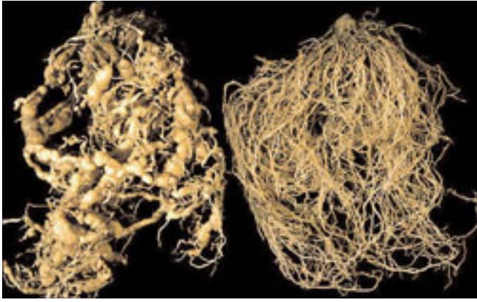
Figure 3. Root-knot nematode-affected root system on left, healthy on right.

Carefully dig up some of the sick plants and examine the roots to see if galls are present (Figure 3). If you are inspecting legumes (beans or peas), be careful not to confuse the galls caused by the nematode with the nitrogen-fixing nodules that are a normal part of the root system (Figure 4). It may be helpful to also pull up a healthy plant and look at its roots for comparison (Figure 3). If roots are knotted, many times also accompanied by severe rotting, then root-knot nematodes should be suspected.