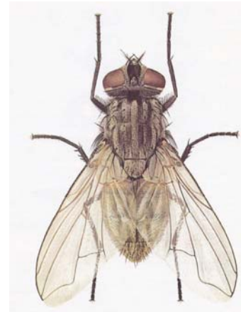
Figure 1. House Fly

The house fly , Musca domestica L., (Figure 1) is the major species associated with poultry manure. This fly breeds in moist, decaying plant material, including refuse, spilled grains, spilled feed and in all kinds of manure. Poor sanitation around the poultry facility increases the probability of high house fly populations. House flies prefer sunny areas and are very active, crawling over filth, people and food products. This fly is an important mechanical vector of many human and poultry diseases (protozoa, bacteria, viruses, rickettsia, fungi and worms) and can cause fly-specking problems with eggs as well as windows and walls of buildings.