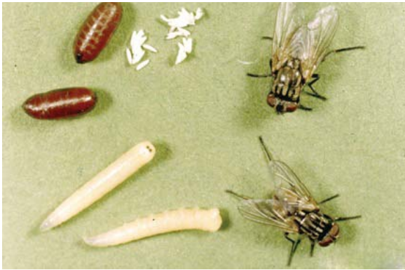
Figure 2. House Fly Life Cycle.

lay two to seven batches of 100 to 150 eggs at 3- to 4-day intervals in cracks and crevices under the surface of the breeding material. Eggs hatch into white, cylindrical, anteriorly tapering larvae (maggots) in 12 to 24 hours (Figure 2).