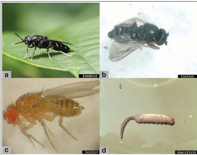
Figure 6. (a) Soldier fly, (b) small dung fly, (c) common fruit fly and (d) rattailed maggot

Soldier flies (Figure 6a), small dung flies (6b), fruit flies (6c) and rattailed maggots (6d) are some of the other flies that can be found in poultry production facilities.