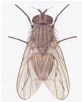
Figure 3. Little House Fly

The little house fly , Fannia canicularis (L.), (Figure 3) resembles the house fly but is smaller (adult 3/16 inch in length) and has three brown stripes on the thorax. This fly is normally associated with litter-type floor housing and open window ventilation. It prefers a breeding medium that is less moist than that preferred by the house fly.