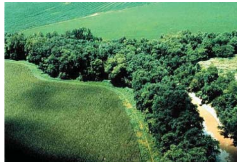
Figure 1. A riparian forest buffer.

A riparian buffer is a strip of vegetation established next to waterways in managed landscapes (such as urban or agriculture) that is designed to capture stormwater runoff, nutrients and sediment (Figure 1). These