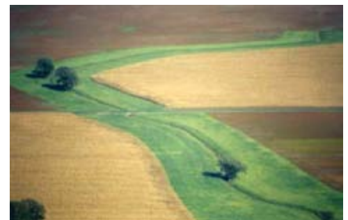
Figure 2. A grass buffer in an agricultural field.

This buffer consists only of grasses and forbs (such as wildflowers) and is typically used along small streams and other drainages that flow through crop fields and pastures. Grass filter strips are usually narrow and contain several grass species that slow and disburse runoff. Grass buffers also can provide valuable wildlife habitat. Native grasses, which are often better adapted than non-natives and less invasive, are desirable for planting. Grasses are most effective at filtering sediment. Grass buffers may require periodic maintenance to control invasion by unwanted plant species and to reestablish grasses. Suggested buffer width is 20 to 30 feet (Figure 2).