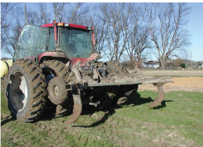
Figure 5. A mechanical sub-soiler.

“hardpan” in the soil. Ripping or subsoiling involves opening a slit in the ground 18 to 30 inches deep. Ripping is typically performed a few months prior to planting (Figure 5).