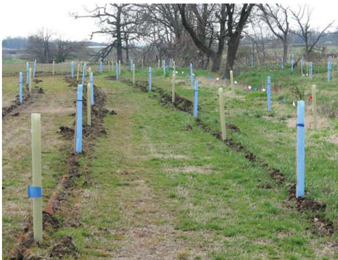
Figure 6. Tree shelters can improve survival and growth of seedlings.

that enhances the growth of seedlings (Figure 6). However, they may be difficult to maintain in flood-prone areas. If larger trees are planted (such as in the urban buffer), mulching, staking and irrigation may be required.