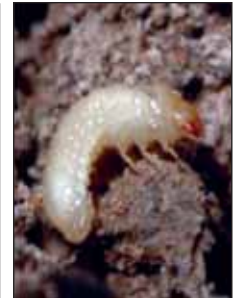
Figure 3. Grape colaspis larva magnified.

deep in the soil (Figure 3). In the spring, larvae move upwards in the soil, seeking plants. Because soybeans are rotated with rice in the MidSouth, GC larvae often have only rice on which to feed (Figures 4-6). Some larvae complete development on rice. However, rice is not a host plant that adults use for oviposition. This is why GC is always worse in rice where soybeans were the previous crop (Figure 7).