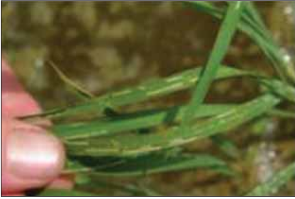
Figure 9. Feeding scars from adult rice water weevils.