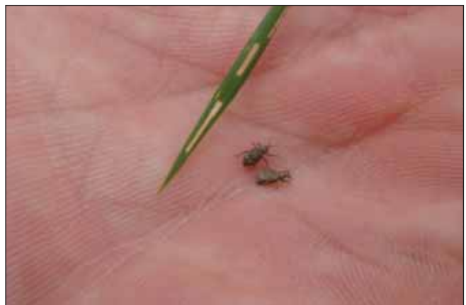
Figure 8. Rice water weevil adults and leaf-feeding scars.

Rice water weevil adults, attracted to the water, come into rice fields at permanent flood. Before then the adults spend the winter hibernating (diapausing) in clump grasses, field trash and wood lines on the edges of fields. Usually RWW is worse in fields that have woods or tree lines bordering the field. When the adults enter the field, they will feed on rice leaves, causing distinctive feeding scars (Figures 8 and 9). This does not cause economic loss. However, these scars are used to determine whether or not remedial action is needed to control developing larval problems. Based on current thresholds for scarring in drill-seeded rice, when greater than 60 percent of new leaves in a field exhibit feeding scars, 10 larvae per soil core can be expected to occur 85 percent of the time (Figure 10). A core is a 4-inch diameter soil sample taken in the center of the drill.