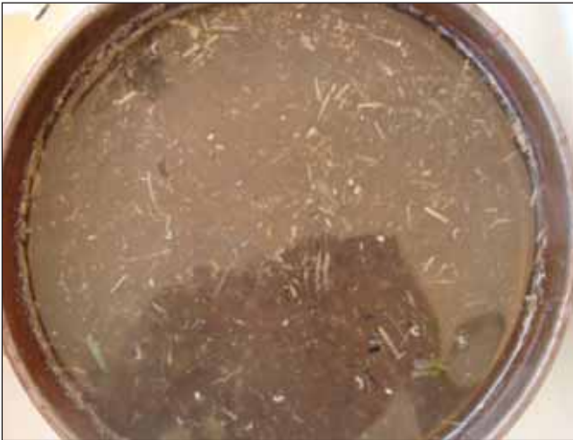
Figure 10. Rice water weevil larvae floating in salt water solution.

Once the RWW female has fed and mated, she will insert white eggs into leaf sheaths under water. In 4 to 9 days, tiny ( \frac{1}{32} inch), white, slender, legless, C-shaped larvae or grubs hatch from eggs and develop through four stages (instars) for about 27 days until they are approximately \frac{1}{3} inch long (Figure 11).