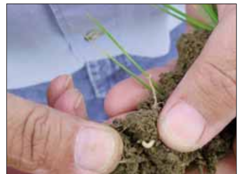
Figure 4. Grape colaspis larva found in soil. Note plant above it is dying from root feeding.

Other than seed treatments, control options or tactics for management of GC have included increased