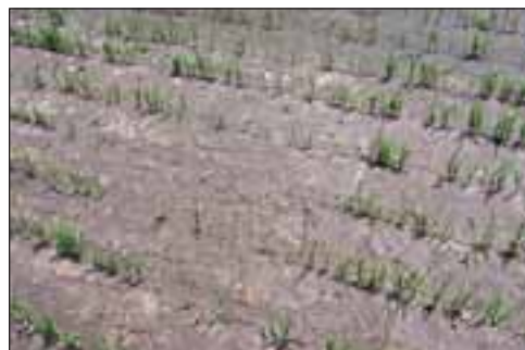
Figure 1. Typical stand loss associated with GC.

For many growers, grape colaspis, or lespedeza worm, can reduce stand early in the season, resulting in a thin stand at flood stage (Figure 1).