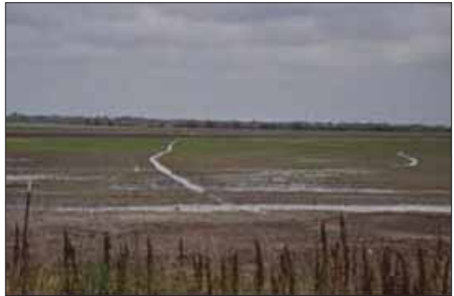
Figure 12. Reduced stand from grape colaspis and increased rice water weevil problems resulting.

RWW adults are also attracted to thin stands, so growers who experience stand loss from GC earlier in the season face a double jeopardy of having worse than average RWW infestations (Figure 12).