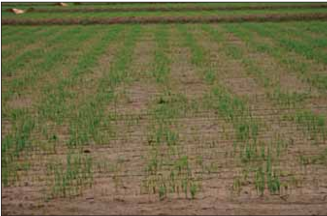
Figure 7. Grape colaspis infestation causing “bean row” effect often associated with high populations.

seeding rate, increased nitrogen fertilization and foliar applications of pyrethroid insecticides.