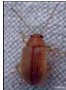
Figure 2. Grape colaspis adult.

Legumes such as soybeans are primary hosts of grape colaspis (GC) adults (Figure 2). Multiple generations are common in legumes, and the last generation of larvae overwinters