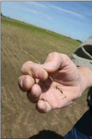
Figure 6. Rice seedling dead from grape colaspis feeding shows the unique girdling-type feeding of the larva.