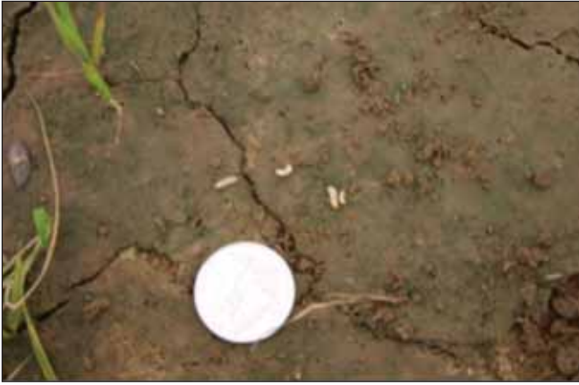
Figure 5. Grape colaspis larvae with a dime to show small size of larvae.