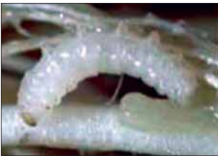
Figure 11. Rice water weevil larva on roots.

Once the RWW female has fed and mated, she will insert white eggs into leaf sheaths under water. In 4 to 9 days, tiny ( \frac{1}{32} inch), white, slender, legless, C-shaped larvae or grubs hatch from eggs and develop through four stages (instars) for about 27 days until they are approximately \frac{1}{3} inch long (Figure 11).