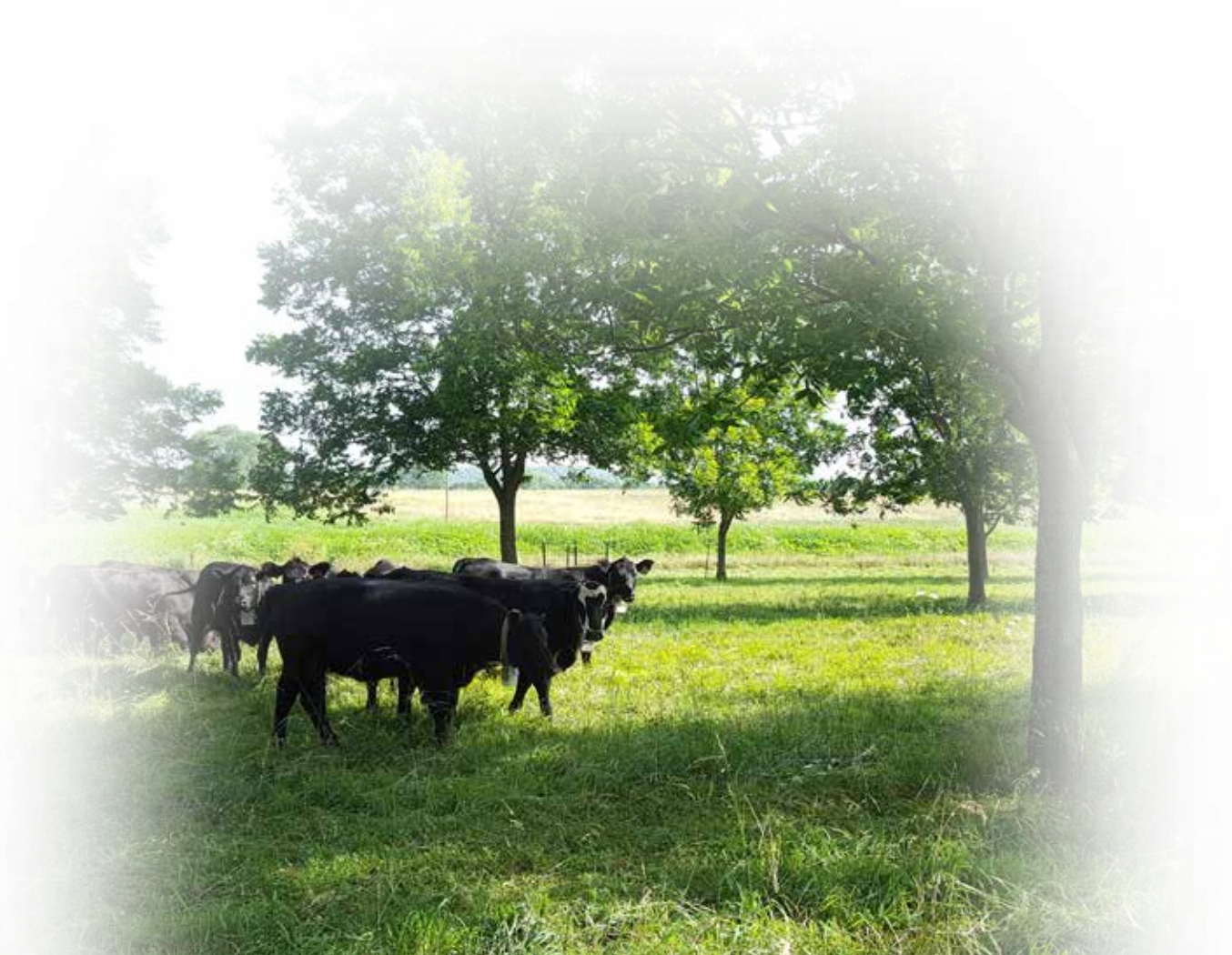
FIGURE 10. Shade is important to cattle productivity and should be managed to reduce potential non-point source pollution.

Shade is important to cattle productivity and should be managed properly. Cattle may select natural shade as a loafing area, or producers may provide artificial shade to provide heat relief for their cattle. If cattle use the shade a few hours a day, manure accumulation and loss of vegetation will result. Move portable shade on a regular basis to allow for vegetative regrowth. Rotate pastures or use electric fencing to keep cattle from concentrating in one small area if they are loafing under natural shade. This reduces the potential for damage to trees and vegetation.