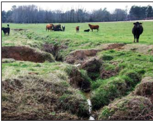
FIGURE 5. Damage to an intermittent stream caused by uncontrolled access of cattle. The streambanks recovered rapidly after access for livestock was limited.

Providing watering devices off-stream has been shown to be an effective alternative to stream access. Examples such as nose water pumps can provide clean water to animals while minimizing trampling of streambanks. When given the choice, cattle drank from an off-stream water trough 92 percent of the time vs. the time spent