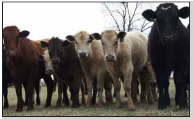
FIGURE 2. Beef production is a vital contributor to the Arkansas agriculture. The total impact of the state's beef industry is over $1.4 billion.