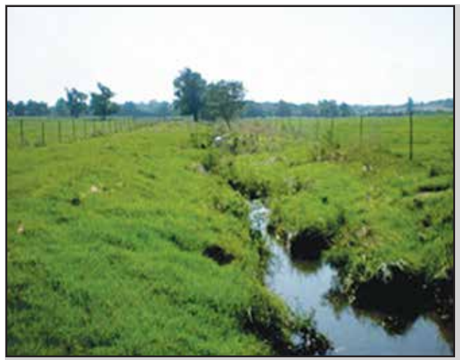
FIGURE 6. Healthy banks surrounding an intermittent stream in a pasture setting.