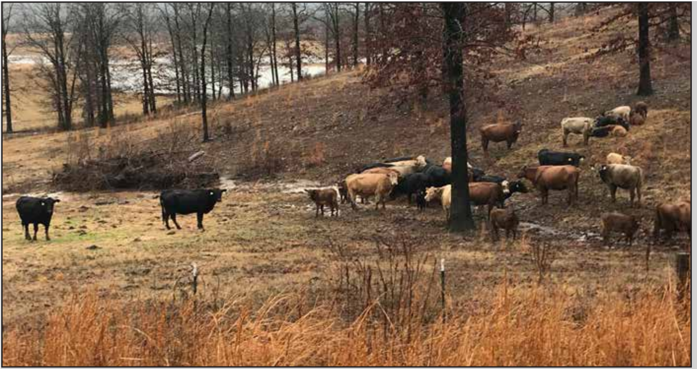
FIGURE 9. Cattle should be managed in ways that limit access to ponds and creeks. Fencing is the most effective option, but other options exist.