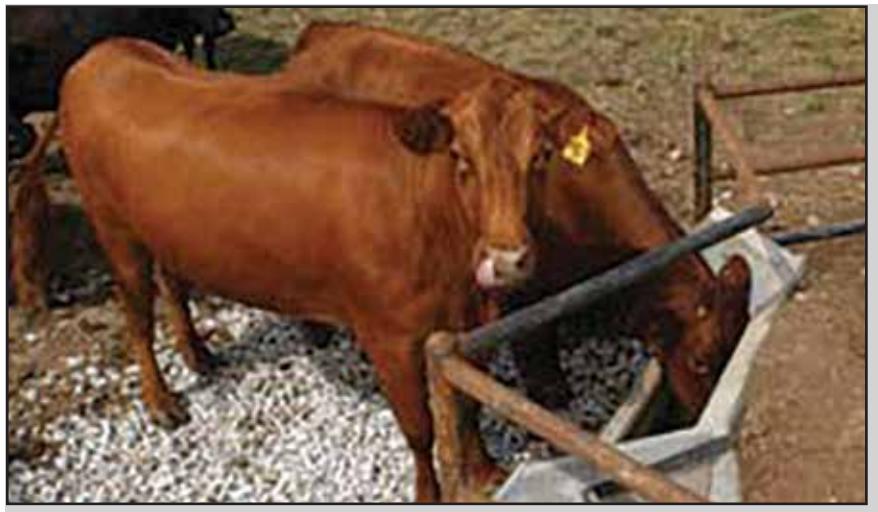
FIGURE 8. Off-stream watering devices can reduce cattle damage to pond banks and ensure the availability of water in a safe manner. In the picture above, the soil surrounding the water access point is protected with coarse gravel to prevent the development of muddy conditions.

Grazing methods utilized depend on the situation, but rotational stocking will likely be more beneficial from an environmental standpoint than continuous stocking. Furthermore, other methods such as strip grazing can be used to move cattle through sensitive areas quickly. Creep grazing can be used to give calves access to lush vegetation that usually develops in riparian zones due to generally higher soil moisture in these areas.