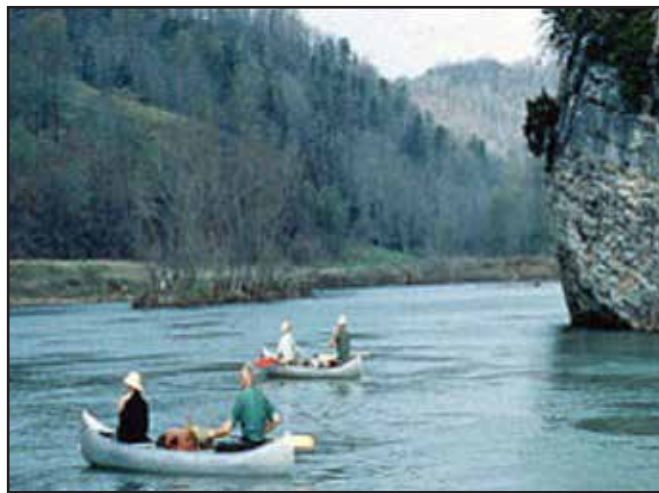
FIGURE 1: A major concern in beef cattle management is to protect the quality of our state's water resources. This photograph of the Buffalo National River courtesy of National Park Service, U.S. Department of Interior.

The goal of pollution prevention in livestock agriculture is to avoid the contamination of ground and surface waters with undesirable bacteria and excess nutrients from manure. The two primary nutrients of concern are phosphorus and nitrogen. While both elements are essential nutrients for living organisms, excessive amounts in water bodies can cause eutrophication, a process in which aquatic plant growth is accelerated. The resulting microbial decomposition causes the depletion of dissolved oxygen, essentially depriving other organisms of this crucial element. In turn, populations of desirable fish such as crappie and bass may decline, while more low-oxygen tolerant species such as carp may increase. Furthermore, livestock manure can be a source of disease-causing organisms. These pathogens can infect humans and animals alike through contact with a contaminated water source.