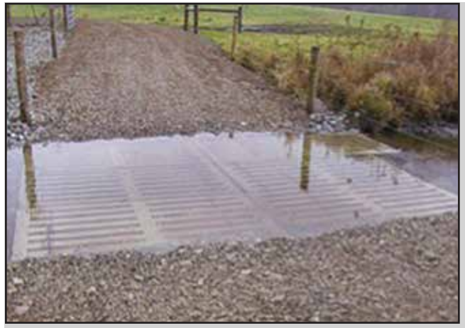
FIGURE 7. Example of a well-constructed cattle crossing. These structures help maintain streambank stability by allowing cattle to cross the water at certain locations only. Stream crossings vary in design and costs.

in the creek in an experiment conducted in Virginia (Sheffield et al., 1997). During this study, streambank erosion was reduced by 77 percent and in-stream total suspended solids were reduced by 90 percent, total nitrogen by 54 percent, and total phosphorus by 81 percent. During typical, hot Arkansas summers, cattle may still prefer the cooler stream areas, but nutrient transport into streams from feces should be avoided. Time spent by cattle in streams can be minimized by providing shade that is located away from streams. If no other option is available than watering cattle from streams, livestock access points should be protected with gravel similar to a stream crossing, so that animals do not linger, trample banks or otherwise damage the channel structure. For additional information on watering options, refer to Extension Fact Sheet