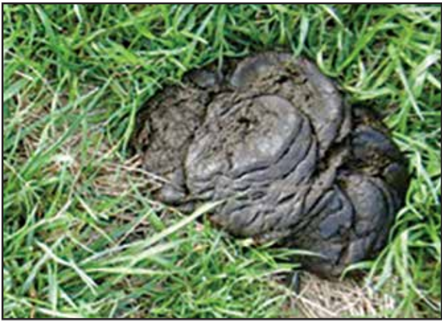
FIGURE 3. The challenge for beef producers is to utilize manure without impacting water quality. This is achieved through appropriate management strategies, particularly maintaining pasture canopy height and applying suitable grazing methods.

Grazing animals can have either a positive or negative effect on water quality, depending on the way their grazing patterns are controlled. Proper grazing management favors pasture productivity and reduces the potential for soil erosion and manure runoff. Healthy and vigorous canopy cover protects and enhances water quality by lessening the impact of precipitation which dislodges soil particles, thereby reducing the amount of sediment in surface runoff as well as the volume of runoff water.