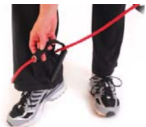
Placing foot through loop