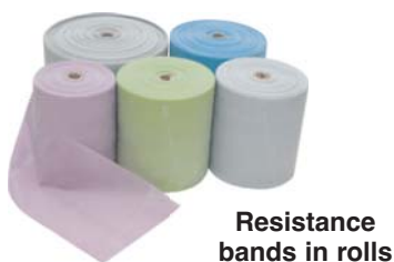
Resistance bands in rolls

Resistance bands (sometimes called flat bands or stretch bands) are stretchy elastic bands that range in width from 2 to 6 inches. Resistance bands can be bought on a roll and cut to your preferred length, but you will most likely buy them precut. Precut lengths usually run from 3 to 6 feet. The level of “resistance” offered in the bands ranges from extra-light to extra-heavy. Many contain latex, so be sure to check the packaging for latex-free if you have an allergy.