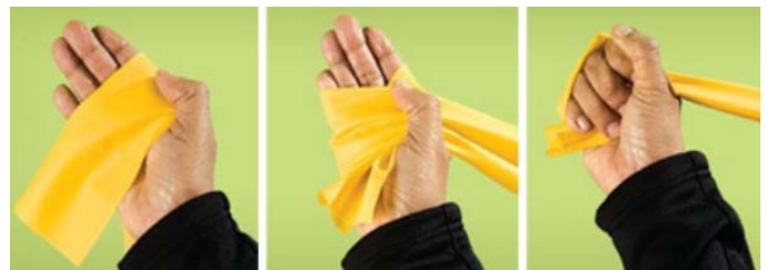
Wrapping a resistance band

Resistance tubes differ from stretch bands in several ways – one of which is that they have handles. Be sure to hold on to the handle so it does not slip out of your hand.