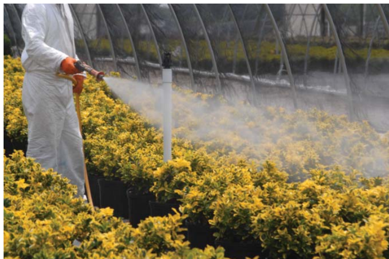
FIGURE 1. Fungicides can be an important component in a disease management program.

Systemic fungicides are absorbed into the plant tissue and may be translocated within the plant. Some materials can enter and move within the conducting vessels of the xylem and phloem and are called “true systemic,” whereas others may only move short distances to immediately