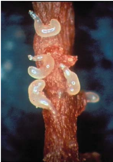
Figure 4. Magnified female reniform nematodes.