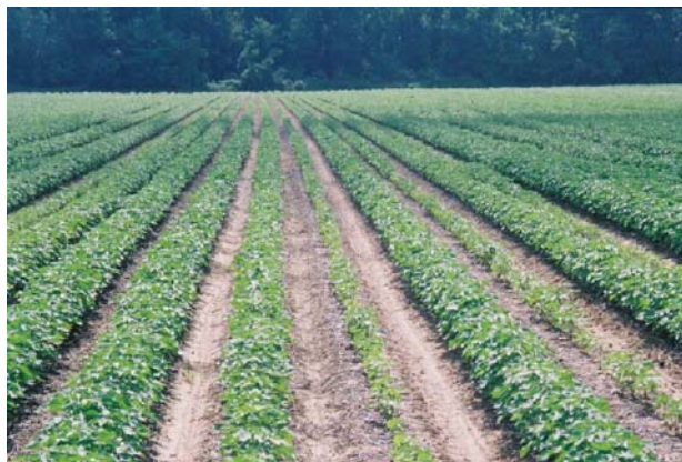
Figure 5. Plant stunting caused by the reniform nematode. Normal rows received a nematicide application to control the nematode.

nematodes may interact with fungal pathogens but not to the same degree as root-knot nematode. They are not restricted to sandy soils and may be found in both clay and silt loam.