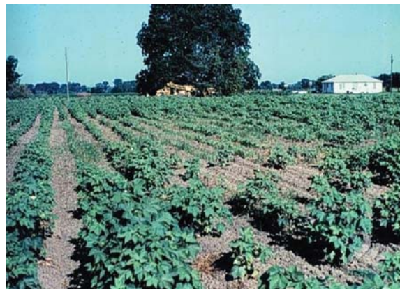
Figure 3. Severe root-knot nematode damage in sandy areas of a field.

nematode species has expanded its range throughout the eastern half of the state, and reniform nematodes have now been identified in both cotton and soybean fields in 11 counties from the Louisiana line to the Missouri Bootheel.