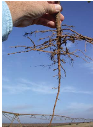
Figure 2. Root galling of cotton from root-knot nematode.

Reniform nematode ( Rotylenchulus reniformis ) is a growing problem in Arkansas (Figure 4). Reniform can be a serious pest in both cotton and soybeans. Prior to 1990, reniform nematodes were known to be present in only a few cotton fields in Monroe and Jefferson counties. However, this