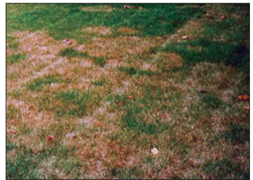
Figure 2. Brown patch in tall fescue

declining turf can occur following infection. Over time, grass in the interior of these patches starts to recover, producing a “smoke ring” appearance ( Figure 2 ).