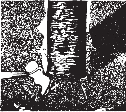
Figure 1. Level ground around tree with a hoe.