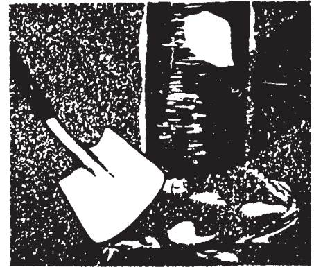
Figure 3. To mound the tree, cover the PDB with three or four inches of soil and then tamp the dirt down with a shovel.

emerging after petal fall, feeding on fruit and laying eggs under skin. Legless larvae then feed on the fruit pulp of apple and prunus fruit. Damage occurs from early April to early May and reoccurs from early June through mid-August. Oriental fruit moth attacks apple and prunus fruit. Eggs hatch into white-pinkish, legged larvae that damage fruit in early May and again from mid-June to early October. Codling moth attacks only apple. Damage is caused by the white-pinkish, legged larvae. It has an emergence pattern similar to the oriental fruit moth but stops laying eggs in early September. Grape berry moth attacks only grape berries. White to greenish, legged larvae attack early grapes in late May, and later generations attack from late June through mid-September.