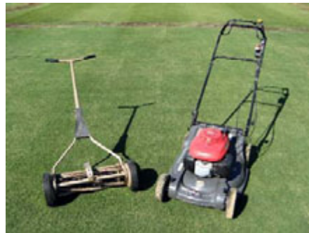
Figure 8. Reel and rotary lawn mowers.

Rotary mowers are by far the most popular type for home-