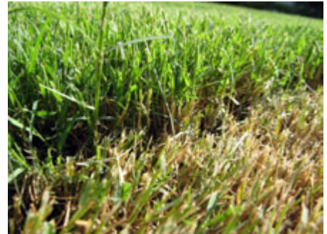
Figure 5. Up-close damage caused by scalping.