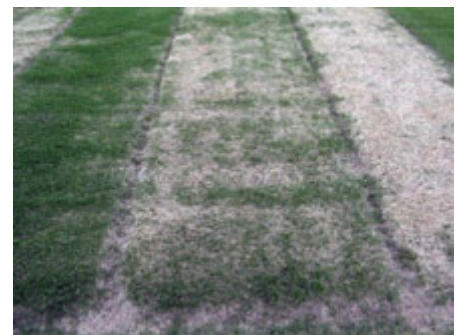
Figure 7. The benefits of an early spring mowing to remove dead leaf tissue are illustrated in this picture. From left to right, the spring mowing heights were 0.5, 1.0 and 1.5 inches on this turf that was maintained the previous year at 1.5 inches.

Before bermudagrass and zoysiagrass begin to grow in the spring, mow the turf slightly shorter than normal to remove dead leaf blades and other debris. This practice will reduce shading of the emerging plants and also