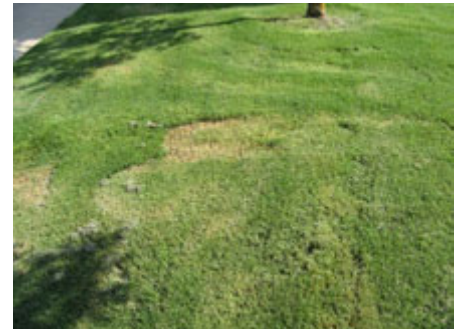
Figure 4. Scalping caused by a rotary mower on hybrid bermudagrass.

Scalping occurs when more than one-third of the leaf blade is removed and the stem is left remaining (Figures 4 and 5). Scalping not only decreases the aesthetic appearance of the lawn but also decreases the health of the plant. Mow frequently at higher mowing heights to avoid scalping. A reel mower will reduce the likelihood of scalping if lower mowing heights are preferred. Additionally, you can alternate the mowing pattern each time you mow to prevent grain and reduce the risk of scalping. Some species like bermudagrass are more prone to scalping than zoysiagrass or tall fescue.