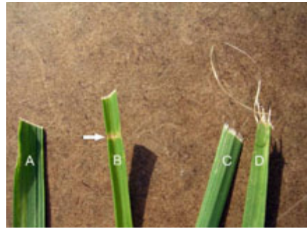
Figure 2. Leaf blade A demonstrates what a leaf blade should look like after mowing. Leaf blade B demonstrates a leaf blade injured by a dull mower blade. Leaf blade C was cut by the mower, but its condition indicates that the mower blade was not sharp enough. The white tissue sticking out of the leaf blades (C and D) is the vascular tissue of the plant. Leaf blade D was mown for quite some time with a dull mower blade.

Sharply-cut leaf blades increase turf health by improving recovery, decreasing water loss and increasing photosynthesis (Figure 2). Lawns mown with a dull mower blade have poor aesthetics, heal more slowly and have greater water loss (Figure 3).