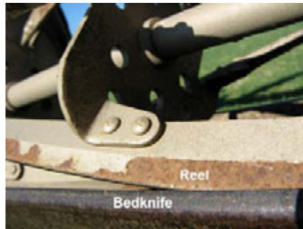
Figure 9. Reel and bedknife components of a reel mower.