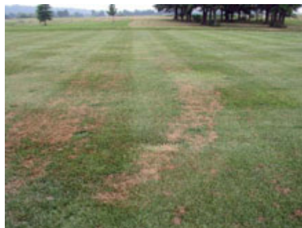
Figure 6. Disease can be spread by mowing equipment when grass is wet.

Lawns are best mown when the turf is dry. Clippings are more easily distributed on a dry lawn because they don't bunch up or clog mowers. Disease organisms are more easily spread in wet turf, and fresh-cut leaf blades offer a point of entry for infection (Figure 6). Wet turf is more easily torn from the ground during mowing by equipment when the soil is wet. Lastly, it is safer to mow when the lawn is dry because there is less risk of slipping and being injured by the mower.