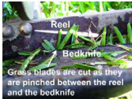
Figure 10. Grass blades are cut with a reel mower in a scissor-like fashion.

owners, although self-powered reel mowers are gaining popularity. Rotary mowers work by cutting the grass blades in an impact, machete-type cut. This cut is less precise and often more damaging to the leaf blade. The potential to scalp a lawn is higher when using a rotary mower, but the height of cut is easy to change and blades are easy to sharpen.