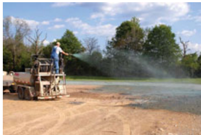
Figure 5. Arkansas lawn being established by hydroseeding.

Hydroseeding is the process where professionals apply seed in a water, fertilizer and mulch slurry (Figure 5). This process was developed in 1953 by Charles Finn in order to help establish turf on