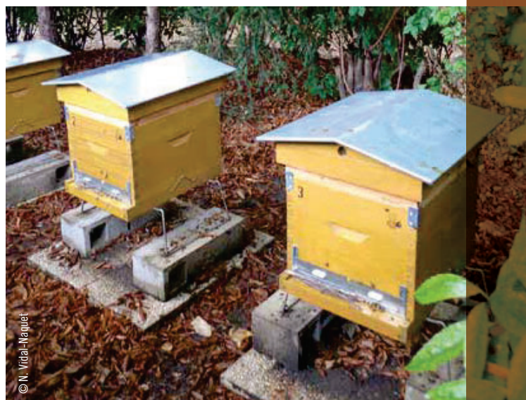
Fig. 3 A farm health audit identifies risky bee-keeping practices (such as risks from the siting of hives)

As part of their remit as private veterinarians with an animal health accreditation mandate ( vétérinaires sanitaires ), veterinarians specialising in bee diseases play a key role in alerting and informing the health authorities of suspected or actual cases of poisoning or high-grade health hazards, as well as in helping to make health decisions.