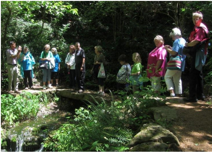
A group of master gardeners admiring a small creek.