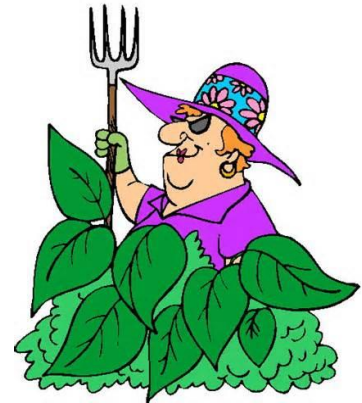
Woman in bushes holding a rake 1