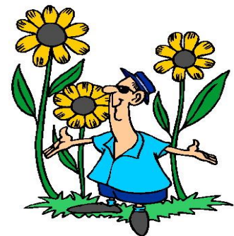
Man standing with sunflowers.