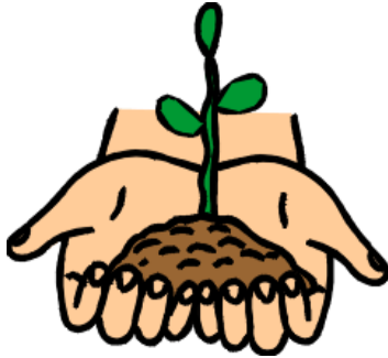
Hands holding a plant.