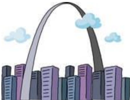
The St. Louis arch.

Garland County Master Gardeners have invited members from other chapters to join them on a bus trip to St. Louis, Missouri August 11-13. The group will spend the day at the St. Louis Botanical Gardens, including the Chinese Lantern Festival the evening of the 12 th . The bus cost is $100, and two nights at the Drury Hotel is $360, including a hot breakfast. Members of the Garvan Gardens gain free admission to the