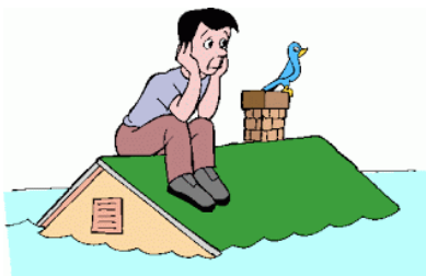
Man sitting on the roof of a flooded house.