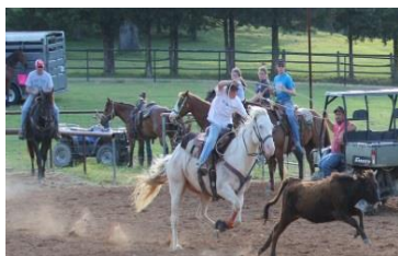
County Horse Show