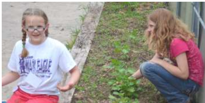
And more weeds!