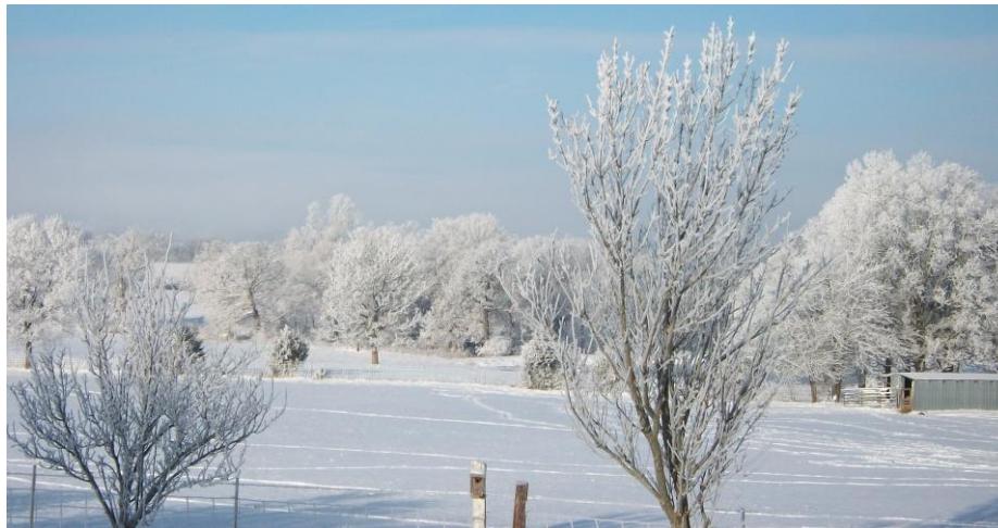
Results of fog and below freezing temperatures – “hoarfrost”

The March 8 th meeting will be held in St. Anne's Catholic Church Fellowship Hall in Berryville at 10:00 a.m.