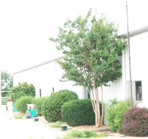
You are correct – it doesn't look like this right now!