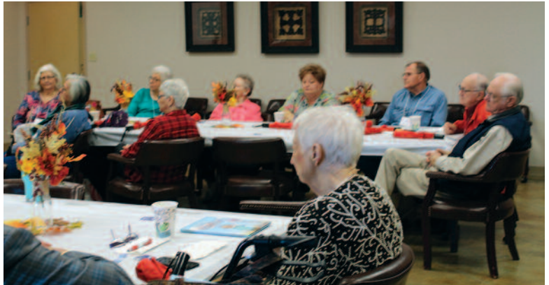
Below: Retirees at the Jonesboro meeting.