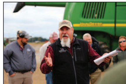
Congressional aides from the offices of several members of the Arkansas Congressional delegation tour the Hare Family Farm and the Newport Extension Center on Friday, Oct. 26.