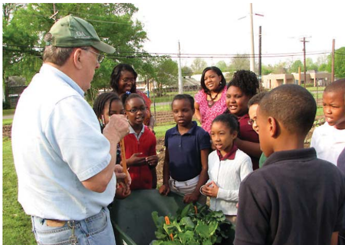
The Jefferson Co. Master Gardeners work with local schools to teach children about gardening and how to enjoy the fruits of their labors. The education outreach is funded by proceeds from the annual Home and Garden Seminar and Show.

The show began in 1988 as a way for the Jefferson County Master Gardeners to help the public learn about gardening, and use the fruits of their efforts to help neighbors keep food on the table through maintenance of a large community garden.