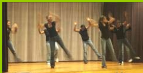
Members of the Geyer Springs 4-H Club participate in the 2007 Fashion and Fine Arts Night Dance competition.

Instrumental Dance Vocal Fashion Revue—Purchased—Casual Fashion Revue—Purchased—Dressy Fashion Revue—Constructed—Casual Fashion Revue—Constructed – Dressy