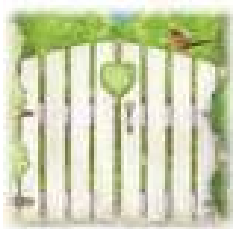
The Marriage Garden