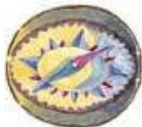
The Personal Journey