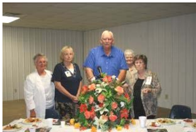
Fulton County Judge signs EHC Proclamation

Heart Club showing the 106 teaching dolls they made for Children's Hospital.