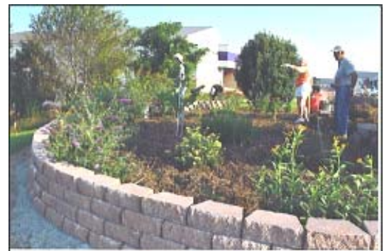
K – 5 Butterfly Garden - AFTER