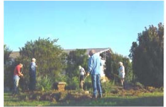
K – 5 Butterfly Garden - BEFORE