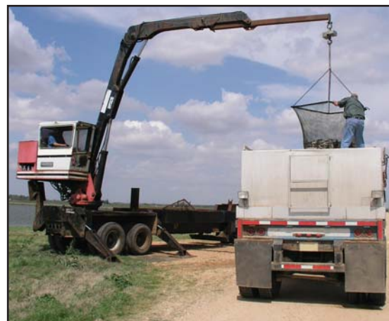
Farmers must prevent loading black carp on trucks hauling catfish out of state.

▶ Maintain stocking records demonstrating that triploid black carp in food size catfish