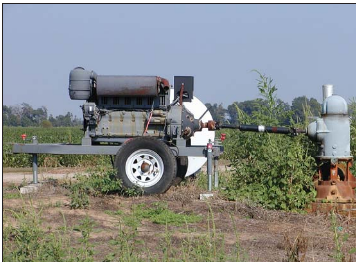
Evaluate the performance of a pumping plant by following simple guidelines. See article on page 4.

NON-PROFIT ORGANIZATION US POSTAGE PAID LITTLE ROCK, AR 72203 PERMIT NO. 502