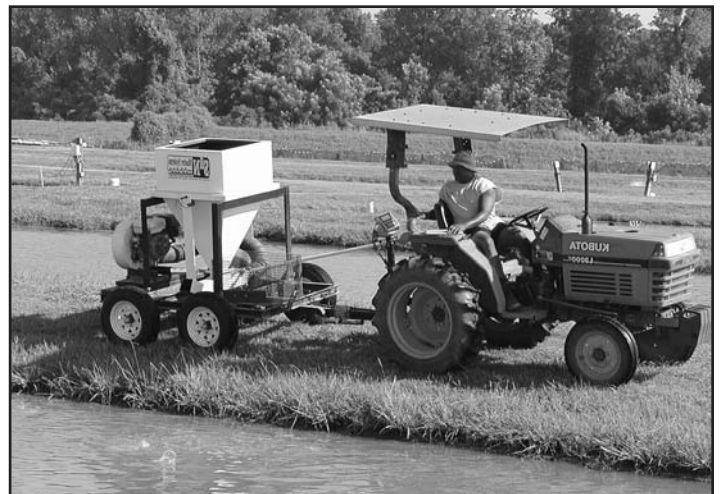
Feeding studies at UAPB are conducted using a mini-version of commercial feeders.