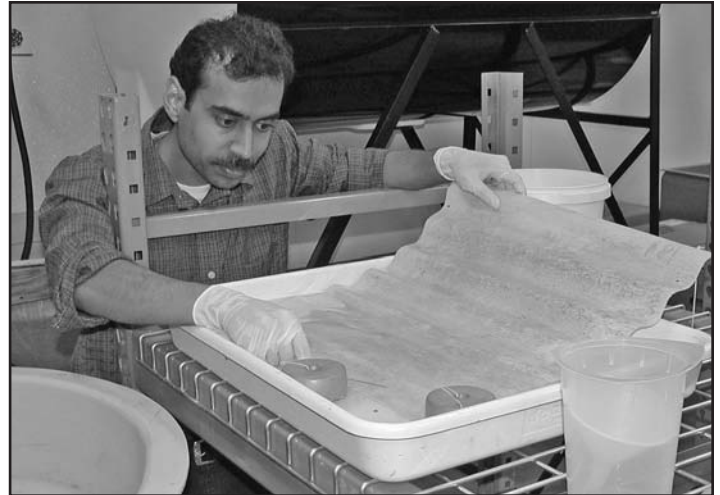
Sathya at work removing fathead minnow eggs from spawning substrates.

Bottom line: They found that poultry fat and plant proteins were suitable ingredients for fathead minnow broodstock diets, equal in performance to the more expensive alternatives. So it's likely that commercially-available baitfish or catfish feeds are appropriate diets for fathead minnow brooders. For more information, contact Dr. Rebecca Lochmann at 870-575-8124 or rlochmann@uaex.edu.