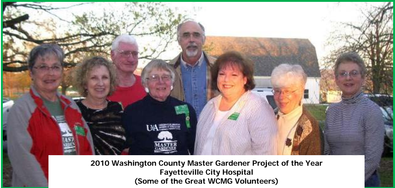
2010 Washington County Master Gardener Project of the Year Fayetteville City Hospital (Some of the Great WCMG Volunteers)