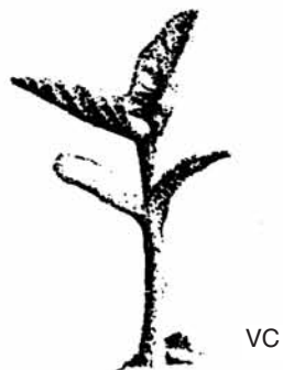
VC Unifoliolate leaves unrolled sufficiently so the leaf edges are not touching.