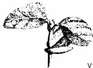
V1 Fully developed leaves at unifoliolate nodes.