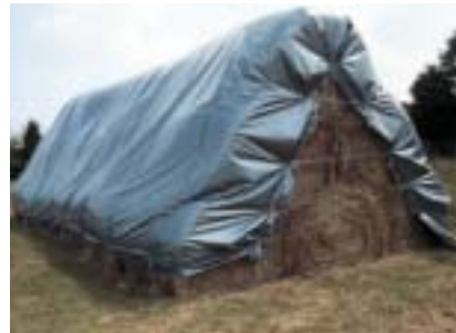
FIGURE 16. Tarps protect round bales from the weather.