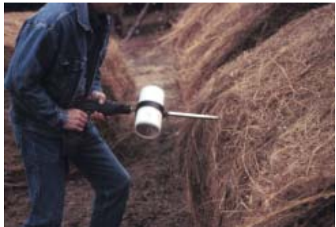
FIGURE 18. Sampling a hay bale for forage testing.

Contact the local county Extension office for more information about forage testing.