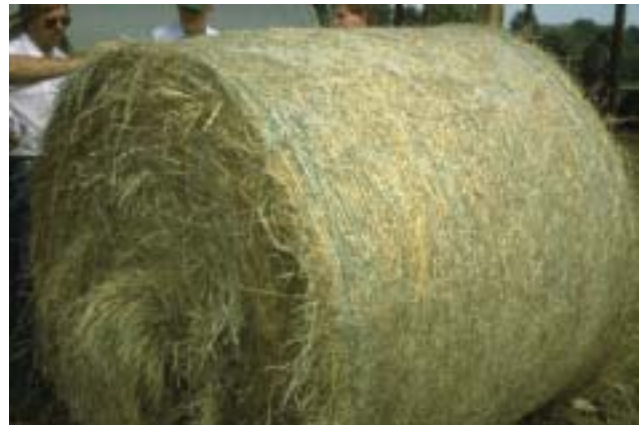
FIGURE 15. Net wrapping can reduce losses for bales stored outdoors.

Hay can be fed successfully in many ways. It may be spread on the ground or fed in bunks or racks. The major task in properly feeding hay is to limit waste. Hay losses during feeding can be expected with any system and can range from 10 to 30 percent. Losses occur from trampling, leaf shatter, chemical and physical deterioration, fecal contamination, overconsumption and refusal.