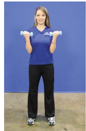
Figure 8. Biceps curl.