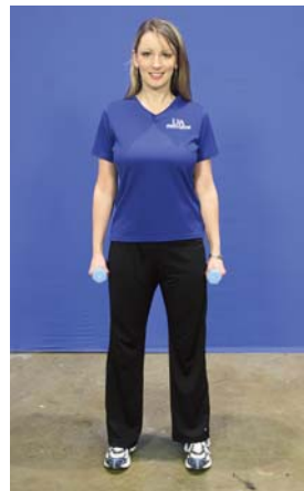
Figure 7. Biceps curl starting position.

Note: As a variation of the biceps curl, you can do this exercise seated and one arm at a time. See Figure 9: Seated Biceps Curl Starting Position and Figure 10: Seated Biceps Curl .