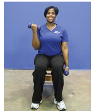
Figure 10. Seated biceps curl.