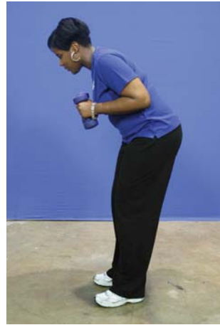
Figure 11. Triceps kickback starting position.