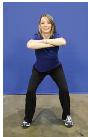
Figure 15. Wide leg squat.