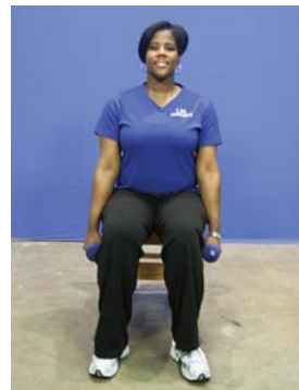
Figure 9. Seated biceps curl starting position.