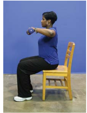
Figure 6. Side arm raise, side view.