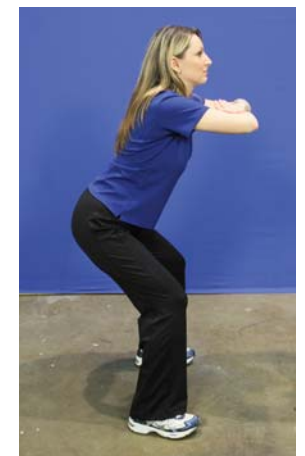
Figure 16. Wide leg squat, side view.