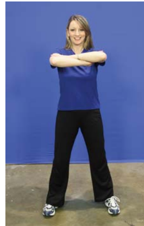
Figure 13. Wide leg squat starting position.

Note: When you are first learning the wide leg squat, you can stand behind a high back chair and hold on for balance.