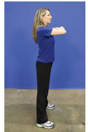
Figure 14. Wide leg squat starting position, side view.