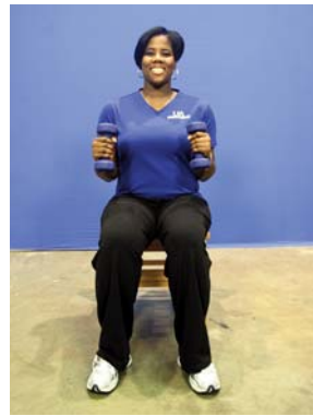
Figure 3. Side arm raise starting position.