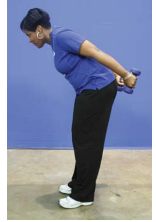
Figure 12. Triceps kickback.

Wide Leg Squat (Works the front, back and inner thigh muscles as well as the buttocks.)