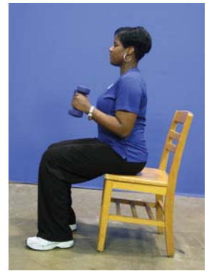
Figure 4. Side arm raise starting position, side view.