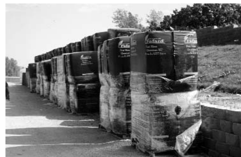
Super bales of peat.

is “wetting up.” Peat moss is inherently hydrophobic (repels water). To address this situation, some suppliers offer a product with a wetting agent already included. Before using peat moss, you should conduct a simple test to see how difficult the product will be to wet. If the product does not include a wetting agent, you can incorporate one, or use hot water if available, to speed-up the wetting process. Peat moss is typically sold in compressed bales that expand 50 to