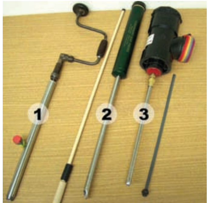
Figure 2. Core sampling devices: (1) Penn State Forage sampler, (2) Colorado Hay Probe and (3) Star Quality Multi-sampler.

taken from the end of square bales and from the side of round bales and stacks.