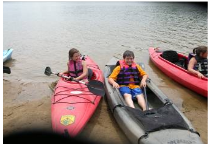
FUN ON THE LAKE