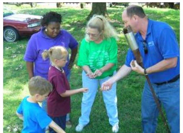
GETTING DOWN AND DIRTY