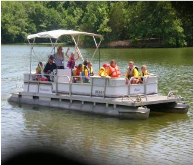
GOING FOR A RIDE