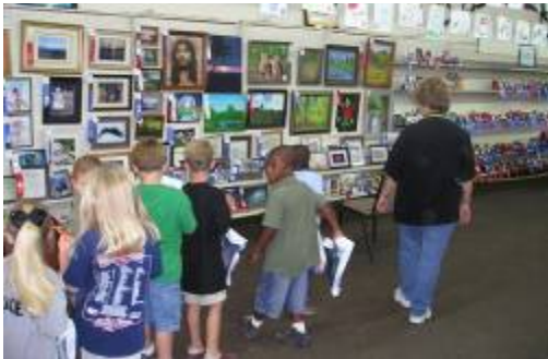
Kindergarten students enjoy the fine arts exhibits at the fair.